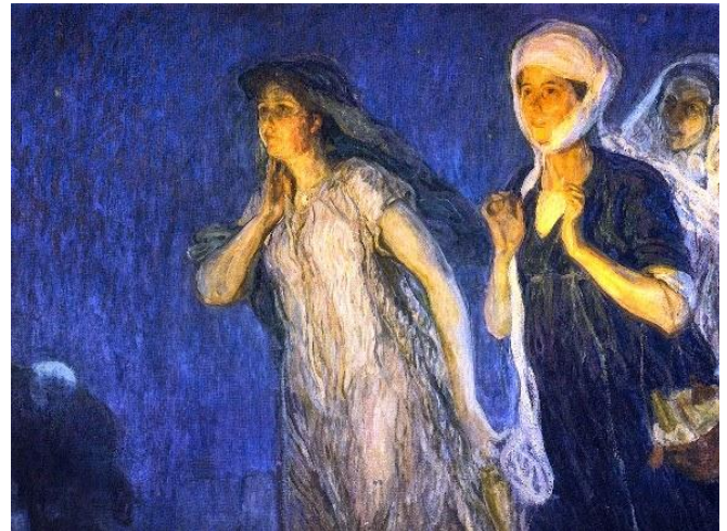
Henry Ossawa Tanner. The Three Marys . 1910

These are the words that the breathless women carried from the empty tomb back to the other disciples. These are the words that have been passed from person to person, from community to community, every day since then -- in secret, in triumph, in darkness, in celebration.